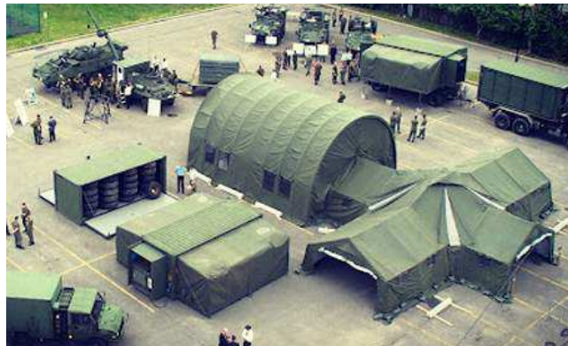
Tactical Operations Centers