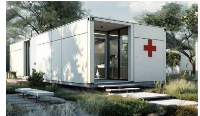
Mobile Field Clinics