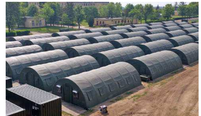
Tactical Operations Camps