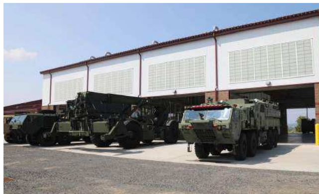
Maintenance Facilities & Hangars