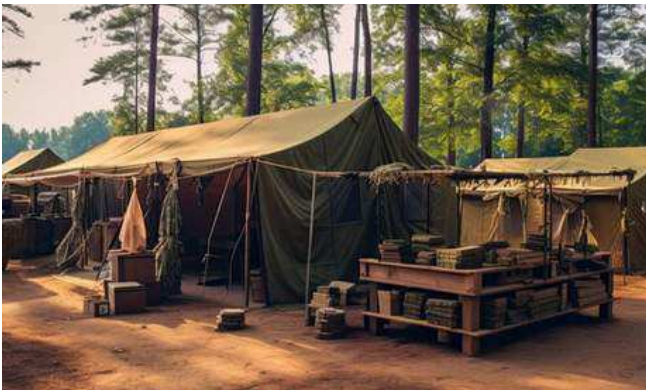
Tents & Field Camps